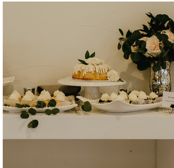
dessert serving platters