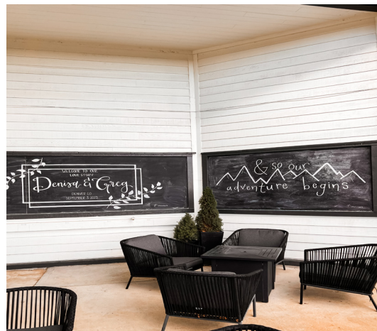
Chalkboard Left Chalkboard: 133" X 47" Right Chalkboard 93" X 47"