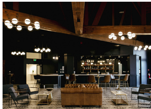
Bar & Lounge See Venue Diagram For Chandelier & Beam Measurements