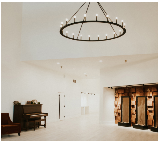
Foyer See Venue Diagram For Chandelier Measurements