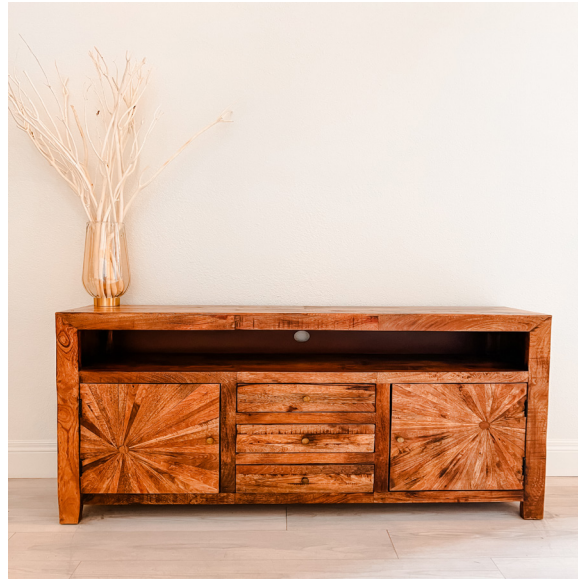
Hutch 65" X 37" X 16"