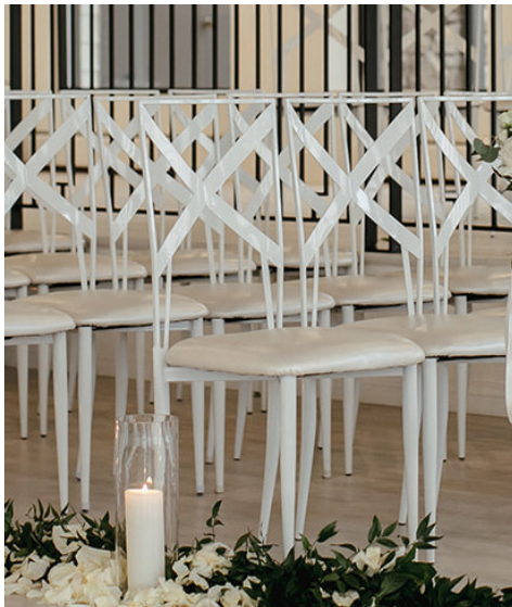
cross back chairs