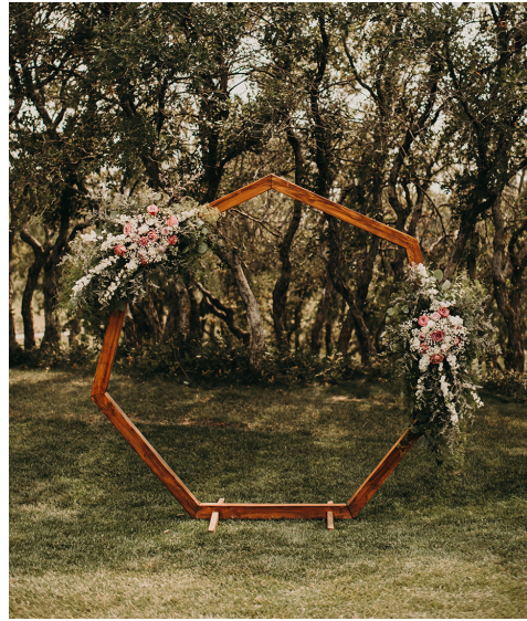
heptagon (7' x 7') / $100