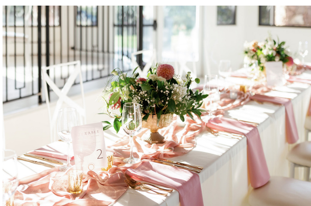
6' Rectangle Tables Seats Up To 6 Guests