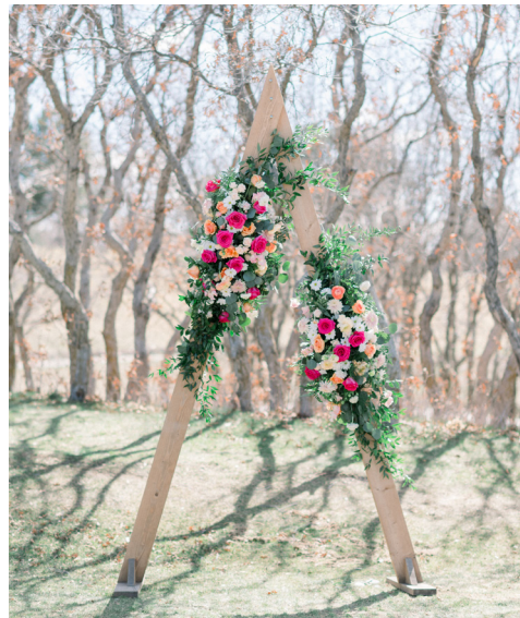
triangle (10' x 6') / $100