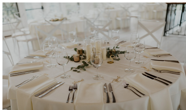
6' Round Tables Seats Up To 12 Guests