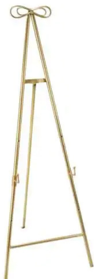
gold "bow tie" floor easel