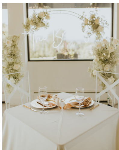
3' Square Tables Sweetheart Table For 2