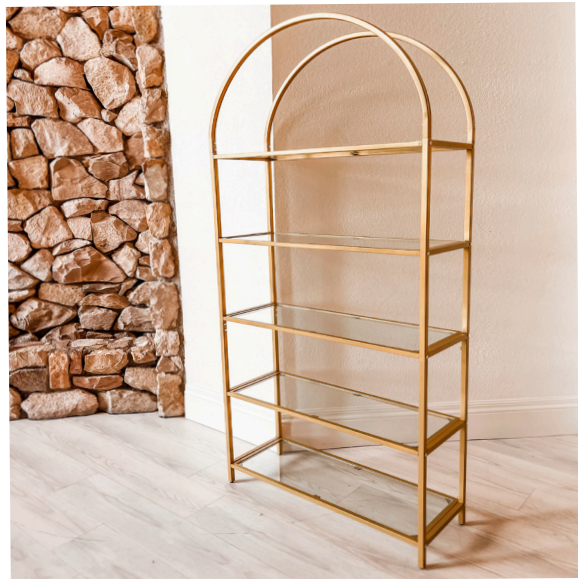
Champagne Wall **Included With Champagne Welcome** 52" (Bottom Shelf - Tallest Shelf) 12" X 32" (Shelf Size) 12" (Between Shelves)