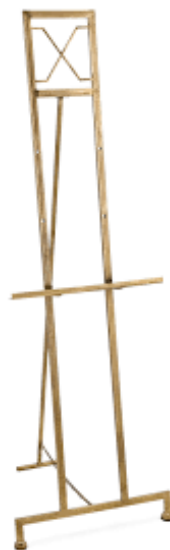
gold "art deco" floor easel