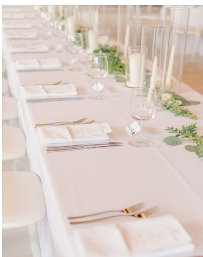
8' Rectangle Tables Seats Up To 8 Guests