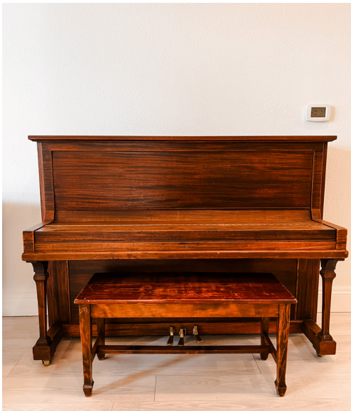
Piano 58" X 52" X 16" (Top Level) 58" X 32" X 11" (Lower Level)