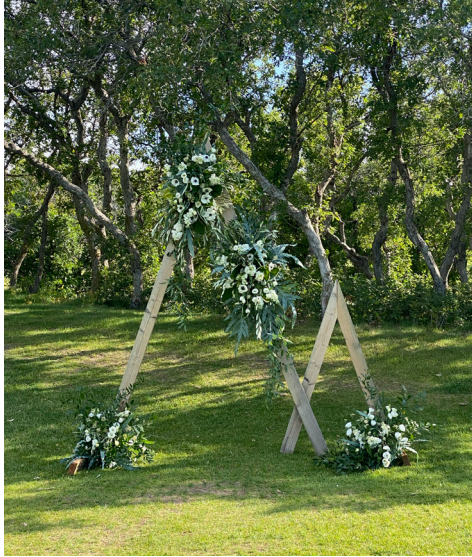
mountain (7' x 7') / $100