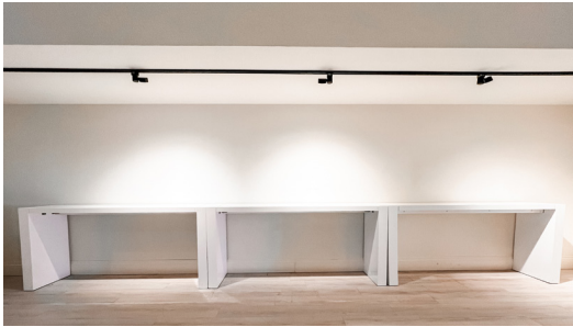
White Console Table (3): 40" H X 18' D X 60' W