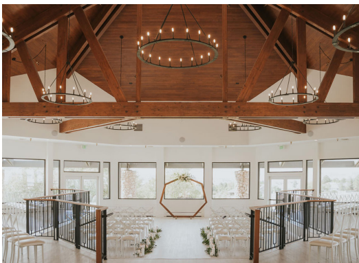
Ballroom See Venue Diagram For Chandelier & Beam Measurements