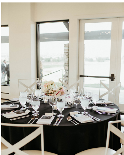
5' Round Tables Seats Up To 10 Guests