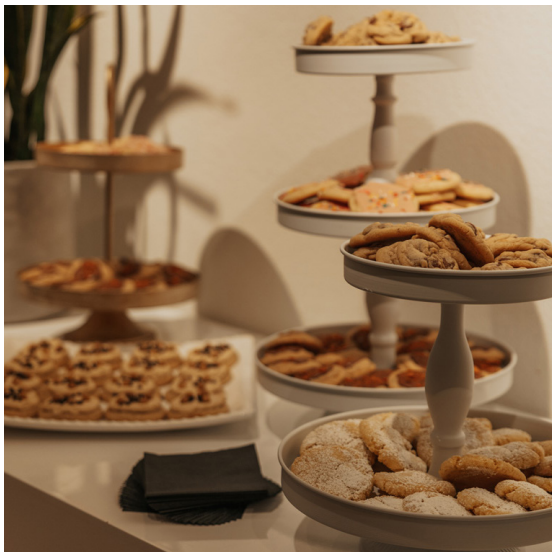
tiered dessert stands