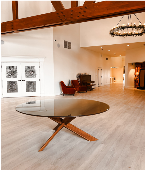
Wood Round Table 64" X 30"