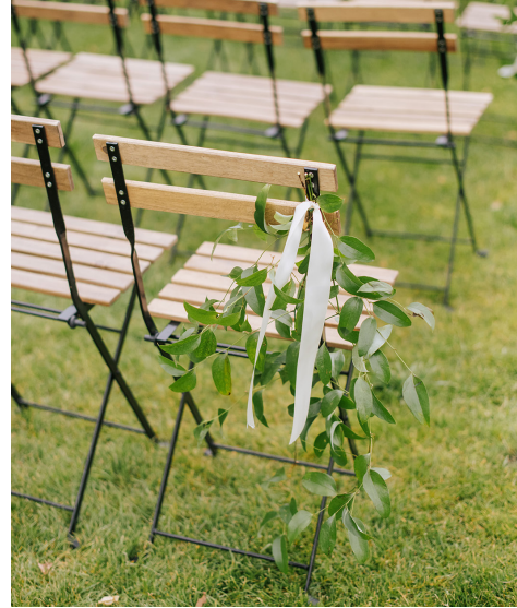
french bistro chairs