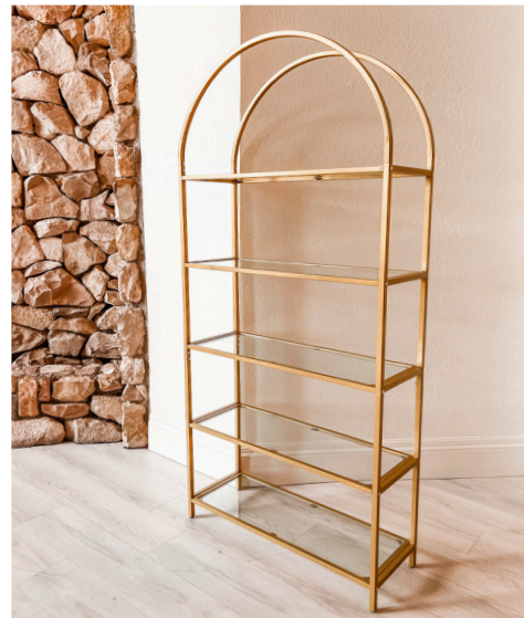
champagne wall included with champagne welcome