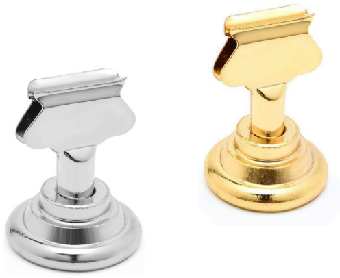
table number holders (silver or gold)