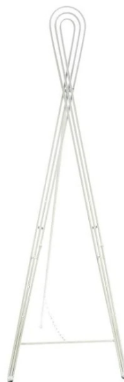
white floor easel