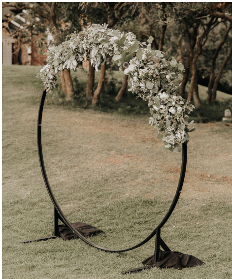
circle (7' x 7') / $100