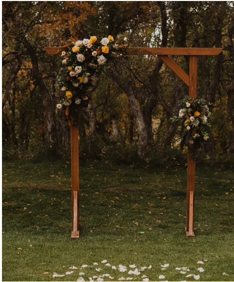
rectangle (8' x 7') / $100