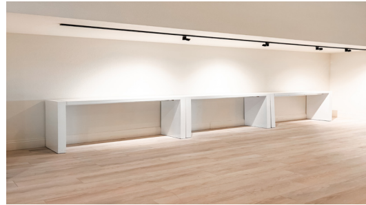
Nook 7' 9" H X 4' D X 19' W